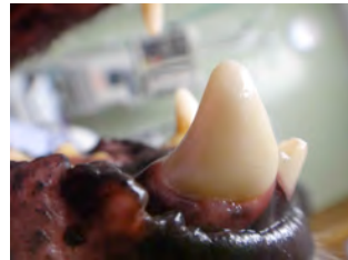
Zirconium Crown (tooth colored)

After placement of the crown, your pet will have full function of this tooth and can chew on any APPROPRIATE toy or surface. We do not recommend tug of war games or hard chew toys such as real bones and hard plastic toys.